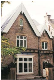
(g) Vertical emphasis & heirarchy of window sizes and forms.