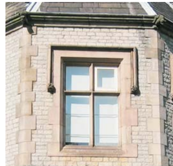
(j) Carved stone, including window/door surrounds, mullion, quoins and hood moulds.