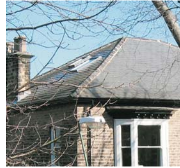
(d) Hipped roofs.