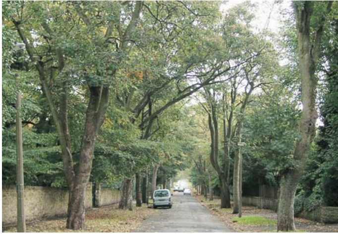
Fig. 13 Lyndhurst Road - one of the finest tree lined streets in Brincliffe laid out in 1868. The trees which frame the vista down the road, were laid out prior to houses being built to create a leafy environment.

8.1 Chelsea Park is the most significant area of greenspace. Formerly part of the grounds of the Brincliffe Towers this attractively sloping area of parkland, with its mature trees, is well used by local people. The parkland itself is largely invisible from the outside, being obscured either by high walls or trees, although the latter do contribute significantly to the visual quality of adjoining areas. Public art within the park is an additional attraction.