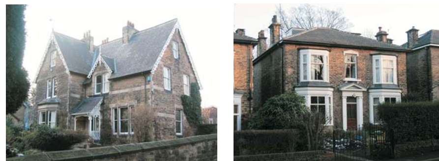
Fig.10 The complex asymmetrical gabled form of the gothic style villa (left) strongly contrasts with the more symmetrical and restrained classical (or Georgian) influenced villas (right).

7.1 Villa development tended to adopt the 19th Century Gothic Revival style popular in this period, although the more restrained Georgian influence is also seen in a number of earlier properties (Fig.10). The gothic style is boldly expressive and richly detailed, with a solid appearance, often asymmetrical in form and commonly with a highly ordered arrangement of gables, dormers, bay window and towers balanced by regular openings or other rhythmic features. The villas possess impressive verticality, modelling and three-dimensional quality, with steep roof pitches, dormers and varied roof forms providing attractive skylines. The more classical, Georgian influence to some houses leads to a more restrained building form, with shallower hipped roofs, simpler and more symmetrical elevations and roof forms, commonly with tall chimneys on either gable.