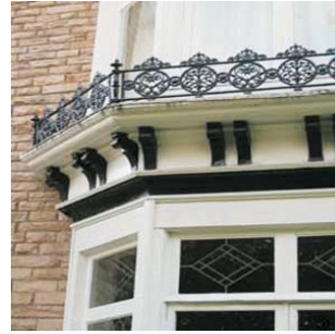
(o) Ironwork as decoration.