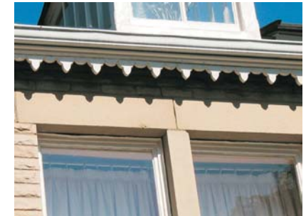
(l) Stone sills and lintels.