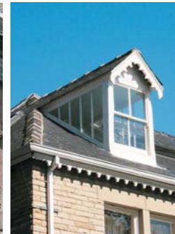
(k) Dormers are characteristic of some Victorian properties. Note the glazed cheeks.