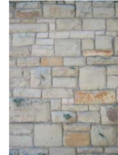
(q) Uncoursed squared rubble - common to side elevations and some inter war houses.