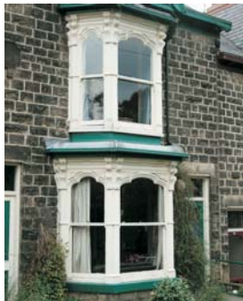
(h) Bay windows, both single and double height.