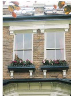
(i) Sliding sash windows constructed in timber.