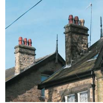
(e) Chimneys with pots.