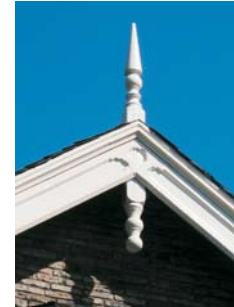
(p) Finials to the apex of roofs.