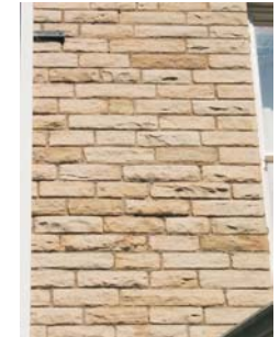
(r) Coursed stone typical to main elevations often in diminishing courses.